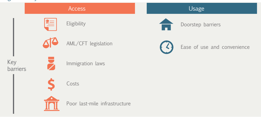
Figure 4: Key barriers to formal remittances

In general, there are two kinds of barriers to adopting formal remittance channels: those associated with access and those associated with usage (see Figure 4).