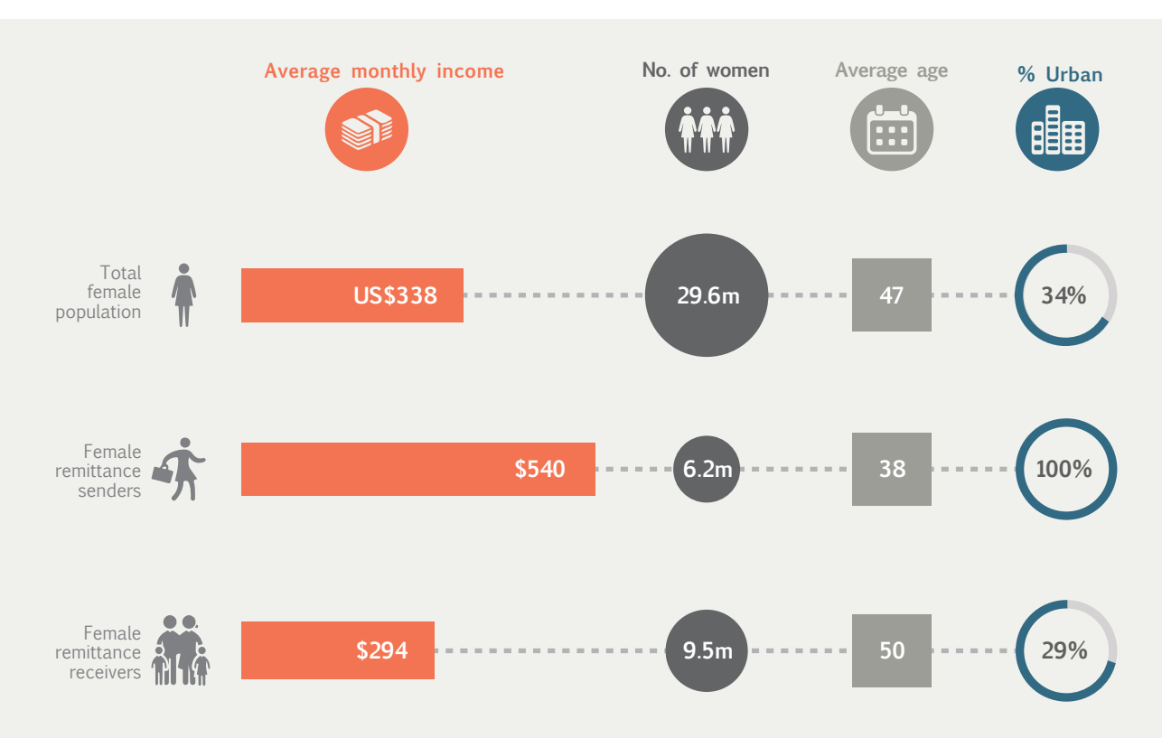
Figure 2: Profiles of women senders and receivers in Thailand

survey of financial inclusion<sup>5</sup> conducted in Myanmar and Thailand, provides a more detailed understanding of both groups of women's demographic background and financial needs and the resultant policy implications for governments and development partners.<sup>6</sup> Figure 2 contrasts the demographic profiles of women remittance senders and women receivers with the entire adult female population in Thailand.