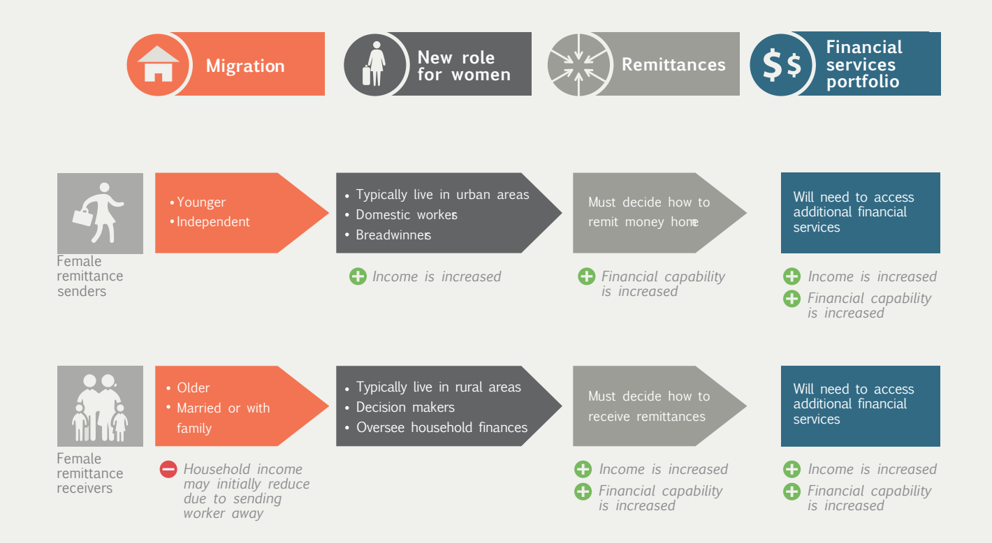
Figure 3: Steps in the migration and remittances progression

For women migrants, the first step is to leave home, followed by finding work in the new country or region, which places them in the role of primary breadwinner for the household back home; if they already were the breadwinner, they now have the potential to earn more than before. For the womenathome group, the migration of a husband or partner implies a new role for them as the primary decision maker at home. This may include managing household finances for the first time. Initially, the household might see a loss of income and savings due to the upfront costs of migration and the immediate loss of a breadwinner who may not have found work yet in the host community.